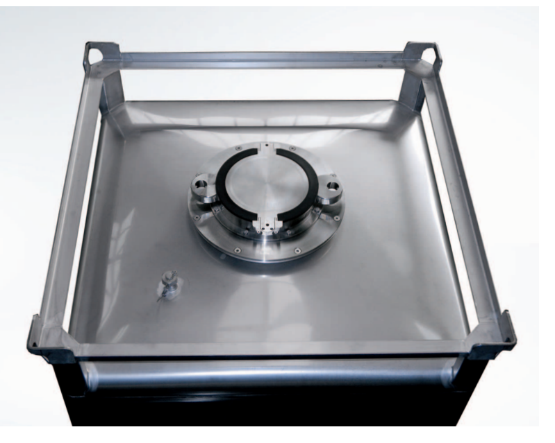
Dust-free filling with Split Butterfly valve system