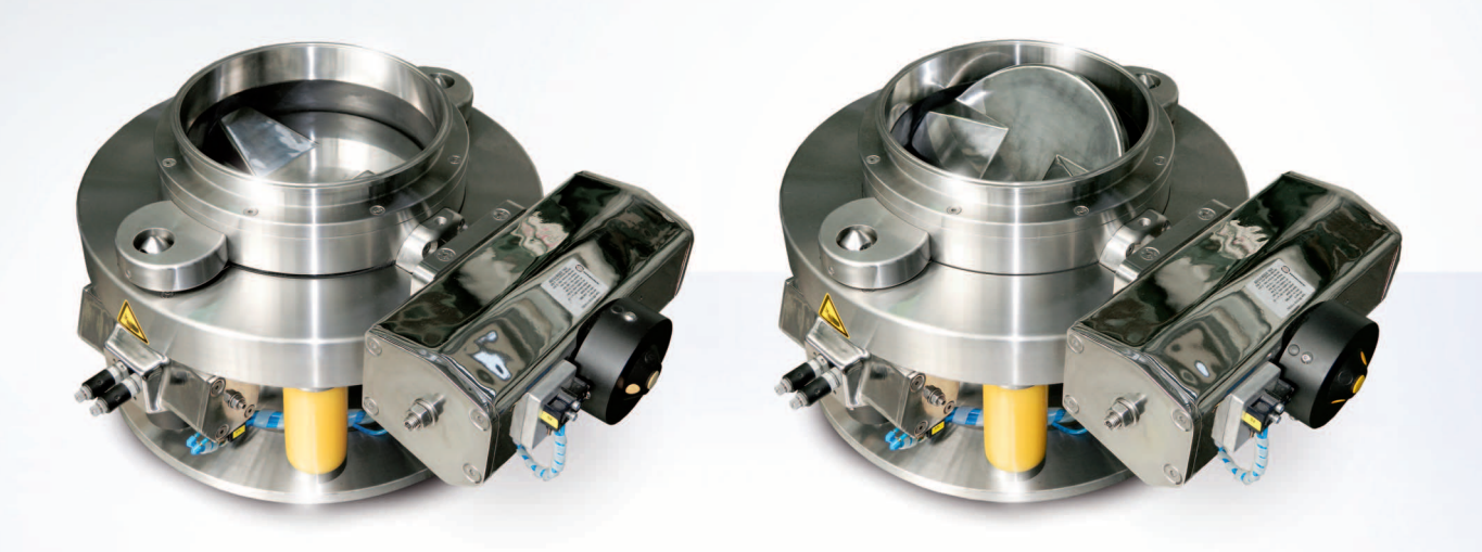
Split Butterfly valve closed