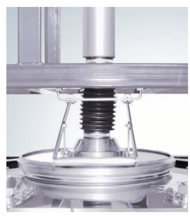
Stirring unit in connected state.