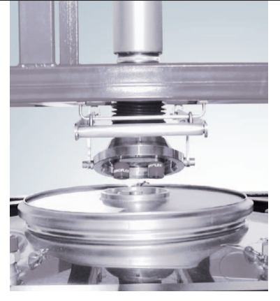
Simple linking of the drive to the stirring unit.