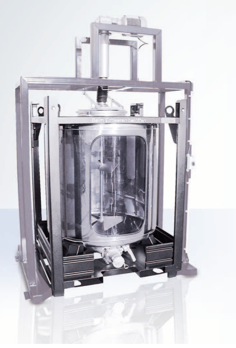
UCON IBCz stirring station is suitable for cubic and cylindrical containers and has a special drive shaft to compensate tolerances.