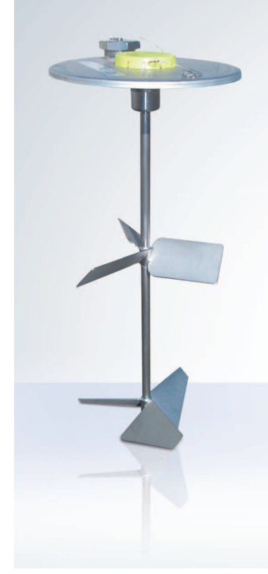
UCON IBCz stirring unit for liquids. Stirring unit can be removed for cleaning.